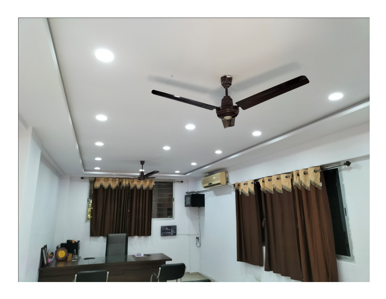
Concealed LED Lights fixed in Principal Cabin.