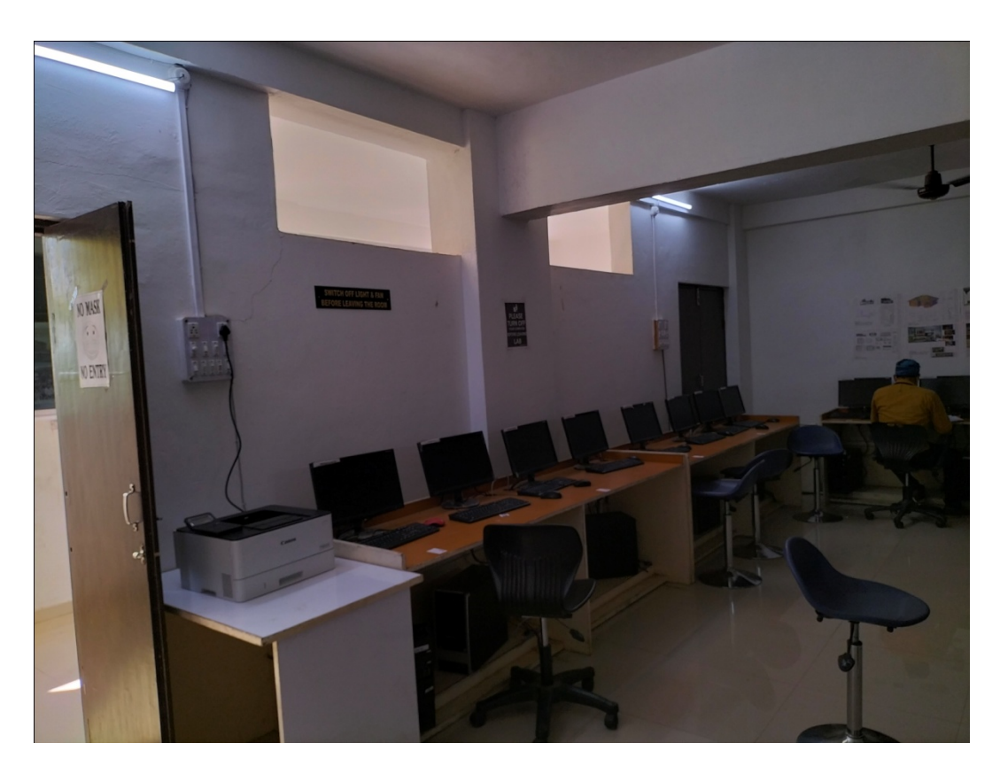
Led Tube Light fixed in Computer Lab